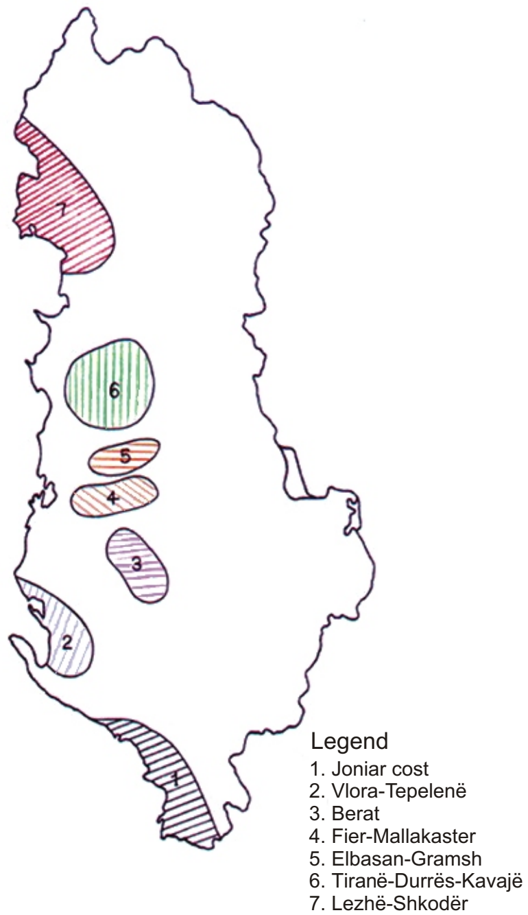
Fig. 2. Origin of the olive growing areas in Albania