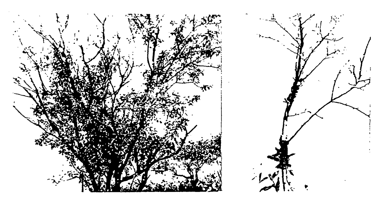
Fig. 2. Hyperplastic bacterial canker symptoms (a) infected almond tree (b) girdled branch.