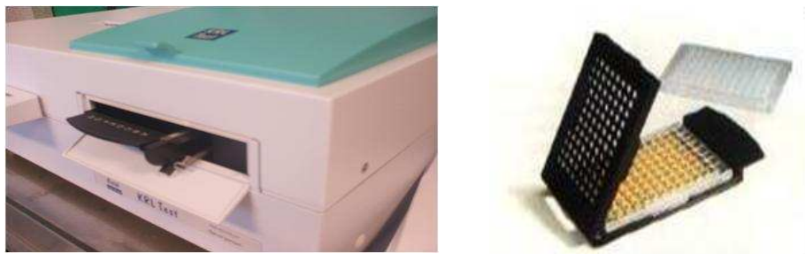
Fig. 1. KRL reader and 96-well microplate.

Total antiradical activity of whole blood and red blood cells (RBC) for each pig was evaluated using KRL biological test (Laboratoires Spiral, France). The KRL test is currently used to test the capability of erythrocytes to resist a standardized production of free radicals generated from the thermal decomposition of a 27 mmol/L solution of 2,2'-azobis (2-amidinopropane) hydrochloride at 37 °C (Prost, 1992; Blache and Prost, 1992). Whole Blood and RBC samples diluted to 1/50 were submitted in isotonic saline solution to organic free radicals. Haemolysis was recorded using a 96-well microplate reader by measuring the optical density decay at 450 nm (Fig. 1).