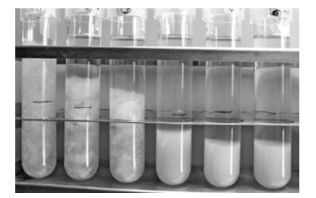
Fig. 3. Settle cell volumes recorded in embryogenic cultures growing at 50 rpm (left) and 100 rpm (right) that show much more packed suspensions.