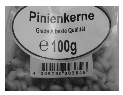
Fig. 2. Commercial lots of Chilgoza pine nuts (left) and Chinese pine nuts (up) labelled in German incorrectly as Piniekerne (i.e. true "Mediterranean pine" kernels).

This situation is a clear incompliance with current legal requirements for food labeling and traceability that should cover all stages of food production chains. The Regulation EC 178/2002 of the European Parliament and of the Council of 28 January 2002 laying down the general principles and requirements of food law, establishing the European Food Safety Authority and laying down procedures in matters of food safety, approved after the disastrous consequences of the Mad Cow Disease (BSE) epidemic, is based on principles in line with the integrated approach 'From the Farm to the Fork', specifically including transparency, risk analysis and prevention, the protection of consumer interests and the free circulation of safe and high-quality products within the internal market and with third countries (EC, 2002). A recent example of the relevance of this regulation for avoiding foodborne illnesses was the EHEC outbreak in Germany in spring 2011, when back-tracing the food supply chain allowed tracking down the origin of the epidemic to fenugreek seed lots imported from Egypt, discarding other suspects such as Spanish cucumbers.