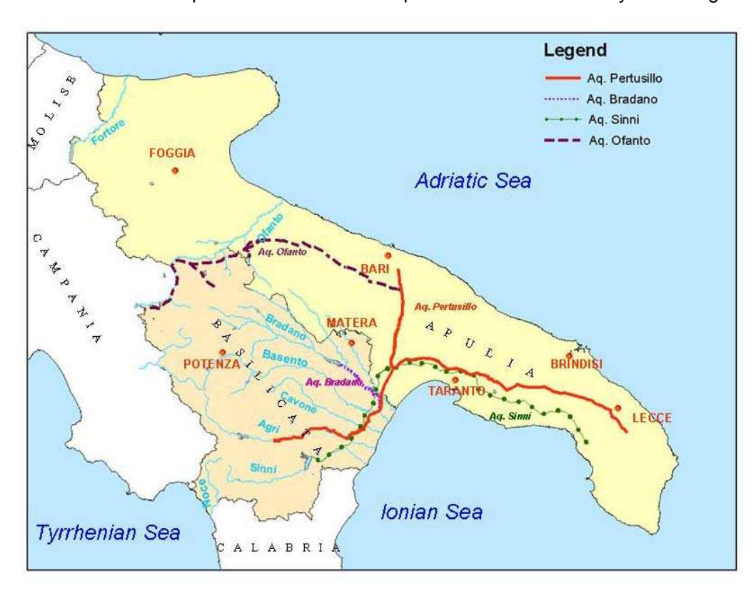
Figure 5. Interconnected water systems

The "Agreement" places a particular focus on the interconnected water systems of Sinni-Pertusillo, Basento-Bradano and Ofanto. The available water resources, looking only at surface flows, have been estimated at approximately 1 billion cubic metres a year. The size of the territories involved in the procurement and utilisation of water supplies is approximately 20,000 square kilometres.