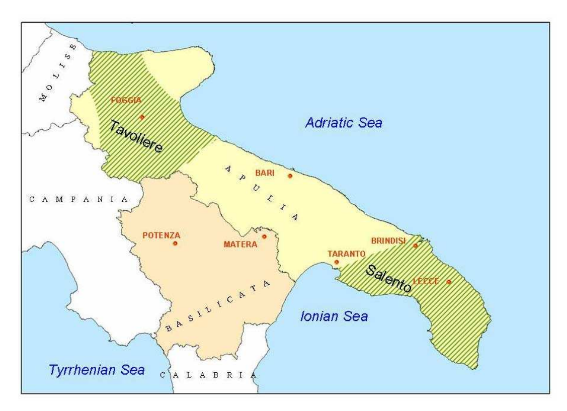
Figure 2. The critical areas in Apulia

In order to overcome the critical situation described, and to reduce the abstraction of groundwater, different solutions have been analysed: