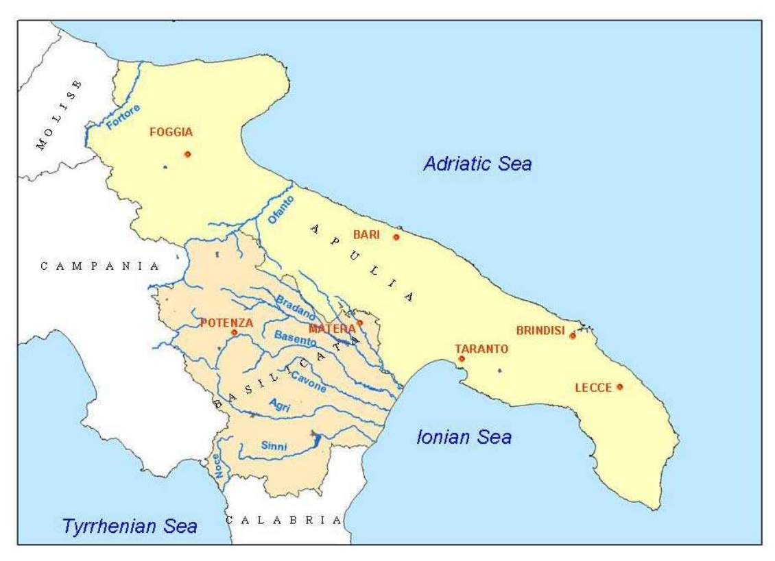
Figure 1. The territorial context

Basilicata (Fig. 1), which territory covers approximately 10,000 sq. km, has radically different climatic conditions from Apulia, given the effect of its major mountain ranges and the influence of three seas (Tyrrhenian, Adriatic and Ionian). Precipitation ranges from an average of 500 mm/year (with a minimum of 220 mm/year) along the Ionic coast to a maximum of some 2,000 mm/year in the Tyrrhenian area. The region can count on major rivers (Bradano, Basento, Cavone, Agri, Sinni, Noce and Ofanto) with significant watersheds and flows of water that have made possible the construction of major reservoirs, allowing multi-year regulation of various uses (domestic, agriculture and industrial).