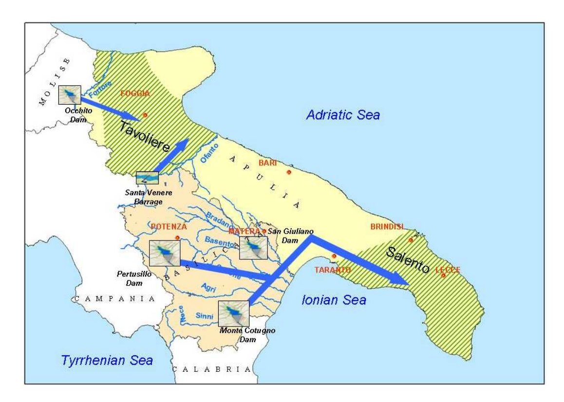
Figure 3. Solutions to overcome water scarcity

The recent infrastructure projects, together with initiatives of water demand management, are important to assure long-term prospects for sustainable development. This need is felt particular in the following sectors: