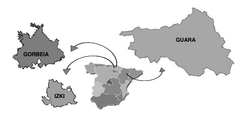
Fig 1. Location of the three Protected Natural Parks

The study was carried out in 3 Protected Natural Parks located in the north of Spain (Guara in Aragón and Izki and Gorbeia in the Basque Country) (Fig. 1), which have different agro-climatic conditions and livestock utilisation regimes. The three areas constitute a diverse range of mountain situations: Mediterranean (850 mm annual rainfall with dry summers in Guara), transition (1000 mm annual rainfall in Izki) and Atlantic (2000 mm annual rainfall with snow in winter in Gorbeia).