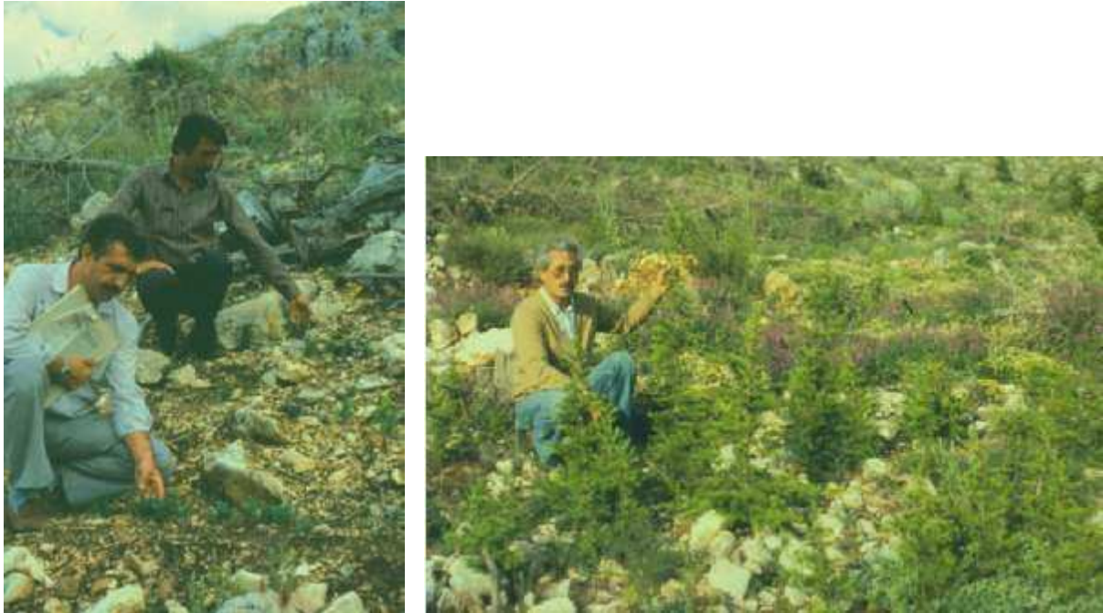
Figure 3. At upper: 2 years old seedlings of Lebanon cedar after broadcast seeding in the same bare karstic land which is seen at Figure 2 in Armutkırı, Anamur, Turkey. Below: 4 years old seedlings of Lebanon cedar which successfully covered the bare karstic land at the same area in Armutkırı, Anamur, Turkey.

project about broadcast seeding of Lebanon cedar based on this report. This first comprehensive reforestation project was applied in the fall of 1984 in Armutkırı, Anamur, Turkey [18,19]. In following years, the area seeded was increased to about 1.000 hectares. Results showed the broadcast seeding method to be very successful, and this application was considered a breakthrough for reforestation of bare karstic lands with Lebanon cedar. (Figure 3 and 4).