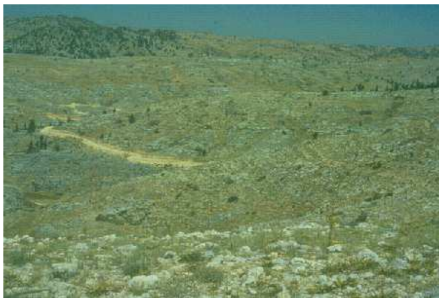
Figure 2. The bare karstic land after the destruction of Lebanon cedar forest since many thousand years, where the broadcast seeding was applied, in Armutkırı, Anamur, Turkey.

The idea of planting by broadcast seeding method by Lebanon cedar in bare karstic lands with shallow or medium soil depth and with bedrock creaks was recommended by Boydak, in the summer of 1983 in Armutkırı, Anamur, Turkey, after his two years observations on Lebanon cedar ecosystems (Figure 2) [18]. He prepared a report which included details of the application of broadcast seeding method [8,18]. Mersin Forest Regional Directorate of Turkish Forest Service prepared a reforestation