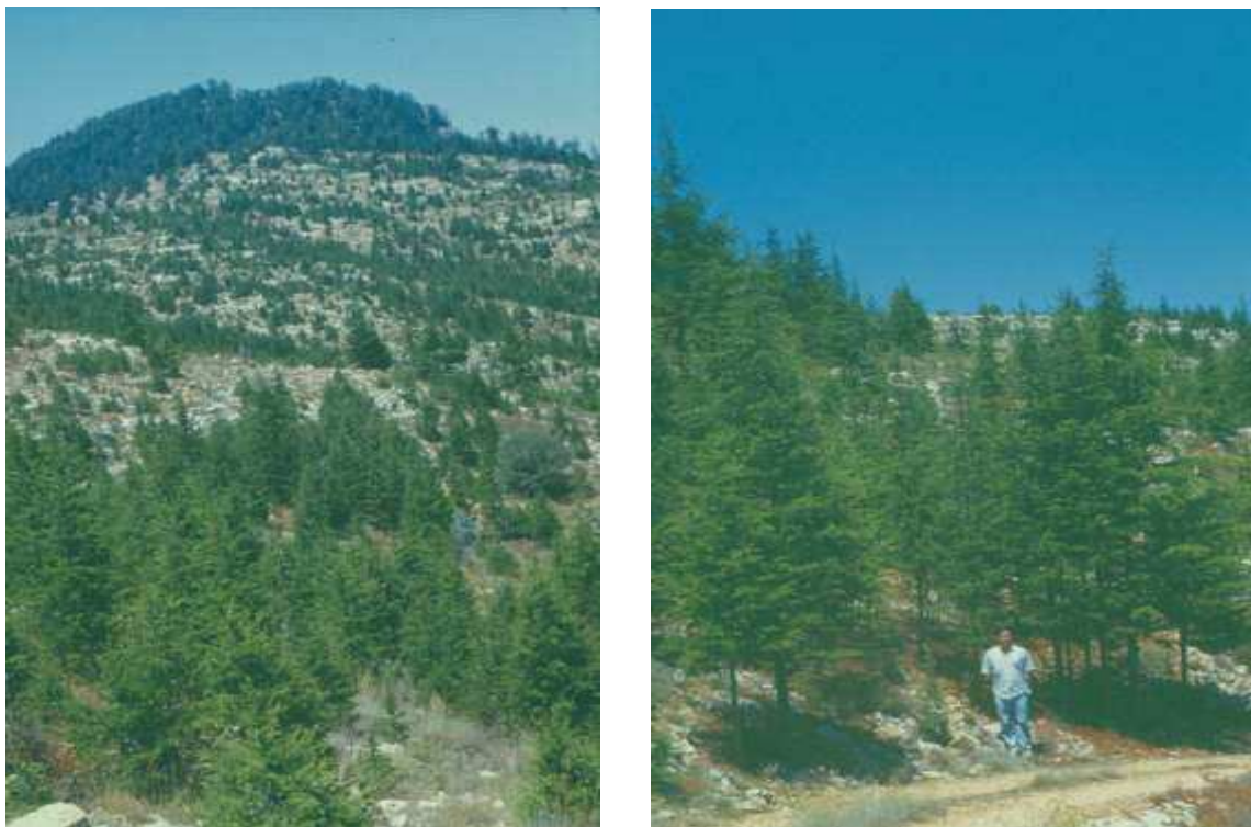
Figure 4. 16 years old trees of Lebanon cedar which successfully covered the bare karstic land in the same area, in Armutkırı, Anamur, Turkey.