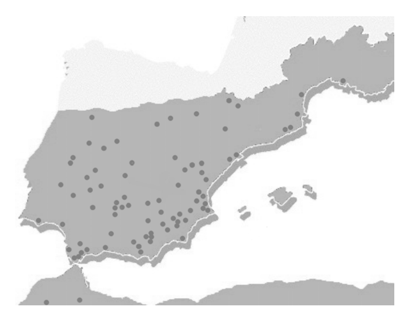
Fig. 1. The 79 Mediterranean areas studied where floristic data are available.

In the Mediterranean Basin, the Ibero-Moroccan region has the greatest variety of plant species, both general and endemic, followed by the eastern part that encompasses Turkey and Greece (Médail and Quézel, 1997). Thus, we considered a set of 79 Mediterranean areas of Portugal, Spain, Morocco and France where floristic data are available (Fig. 1). Together they cover 46,987.53 km<sup>2</sup>, an area larger than Denmark or the Netherlands, and represent satisfactorily the main plant formations of the Mediterranean-type climate.