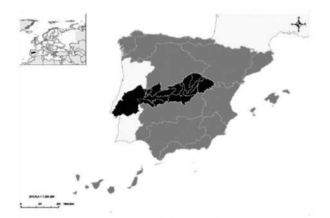
Fig. 1. Location of the Tagus Basin.

The Tagus Basin is located in the central part of the Iberian Peninsula (Fig. 1). The main river runs on East-West direction, with a contributing area of 83,678 km<sup>2</sup>, of which 55,870 km<sup>2</sup> are located in Spain and the rest in Portugal. The administrative body responsible for providing public service regarding water management in the basin is the Basin Authority, Confederación Hidrográfica del Tajo which is in charge of inland water and groundwater. The Confederación Hidrográfica del Tajo (CHT) is an autonomous public organization, which is dependent on the Ministry of the Environment.