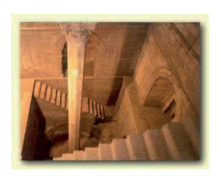
Figure 11. Staircases Nilometers descending into the Nile with marks indicating various levels.