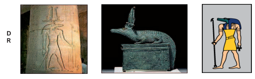
Figure 2: Sobek, the crocodile god worshiped in Esna, Kom Ombo, and Faiyum.