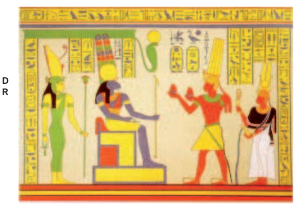
Figure 5. Influence of natural forces on Ancient Egyptian's life.

"The sun and the river, which together formed the dominating cause of existence, made a deep impression on the people. They were two natural forces with both creative and destructive power (Fig. 5). For the life-giving rays of the sun that caused the crop to grow could also cause it to shrink and die. And the river that invigorated the soil with its life-giving silt could destroy whatever lay in its path or, if it failed to rise sufficiently, bring famine. The sun and the river, moreover, shared in the pattern of death and rebirth: the sun 'died' when it sank on the western horizon only to be 'reborn' in the eastern sky the following morning. And the 'death' of the land followed by the germination or 'rebirth' of the crops each year was directly connected with the river's annual flood. Rebirth was, therefore a central feature of the Egyptian scene. It was seen as a natural sequence to death and undoubtedly lay at the root of the ancient Egyptian conviction of life after death. Like the sun and the crops, man, they felt assured, would rise again to live a second life."