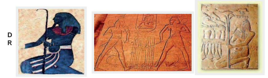
Figure 1. Hapy, the mail god of the Nile and father of gods in ancient Egypt.

The ram-headed god of inundation, or flooding, and creation was Khnum ( Fig. 3 ) who was worshiped at Aswan. He was responsible for creating humans together with their Kas, or guardian spirits. Khnum's wife was the goddess Satet and Khnum's main cult center was at Aswan. The Aswan cult center supervised the water and its distribution from the island of Elephantine northward and from the island of Begah at the First Cataract to the south.