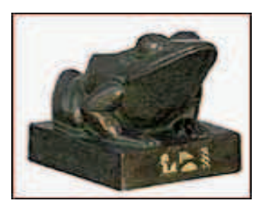
Figure 4. Frog Heket, the goddess of water, usually portrayed near Khnum.