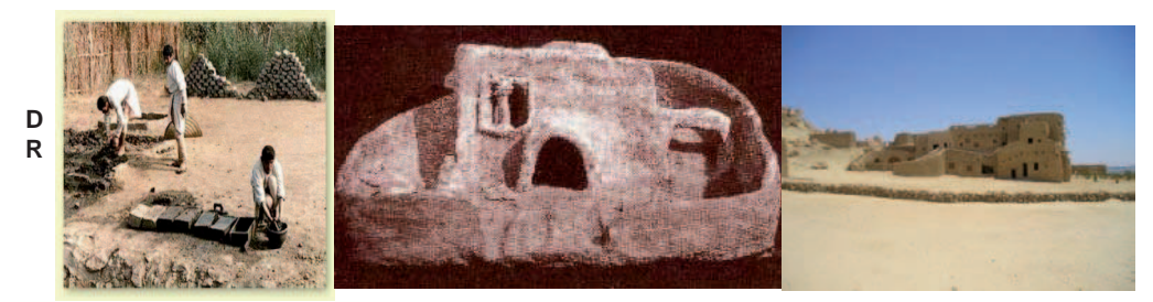
Figure 9. Mud bricks and Houses of ancient Egypt.

The Nile has affected the settlements since ancient Egypt, as the first builders used the silt from the Nile, which was available in great quantities. The farmers homes have walls constructed from bundles of reeds coated with a mixture of chopped straw and argillaceous mud taken from nearby irrigation ditches. The roofs were covered with palm frond to provide them with protection from the sun and from extreme temperatures ( Fig. 9 ).