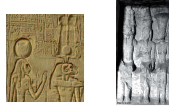
Figure 3. Khnum, the ram-headed god of inundation, or flooding, and creation, worshiped at Aswan.