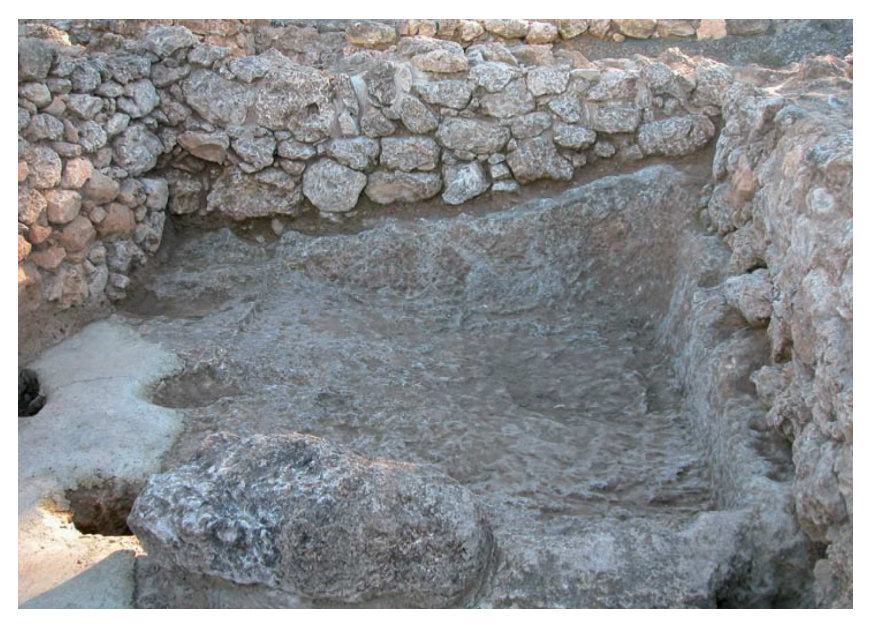
Figure 3: Detail view of an artisanal area used by a dyer (Olèrdola, Barcelona province).

Another recently identified industry practised by the Iberians, which also required large amounts of water, is wool dyeing. At one end of the settlement of Olérdola (Barcelona), in an area bordered by the wall, an artisanal area was built around the second half of the 4<sup>th</sup> century BC that included a dyer's and a blacksmith's (Fig. 3). This zone had a small channel that drained the excess rainwater from the hill and channelled it outside the walls. The dyer's area, reconfirmed by the analysis of the recovered residues, contained channels cut into the rock with small stone slabs and various tanks for soaking and washing the wool and had fires to heat the liquids (Molist et al. , 2005).