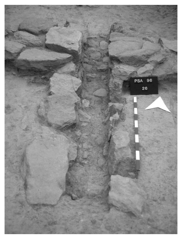
Figure 2: Detail view of example of rainwater drainage systems (Ullastret, Girona province).

The streets were one of the basic elements in the second objective described above: channeling this water from inside the buildings to outside the settlement. As well as performing their primary function of linking the different parts of the settlement, the streets were also part of the drainage system and by arranging their inclines they were able to channel the rainwater away from the inhabited area. The drainage systems in Iberian settlements were linked to the main street that collected the water from inside the buildings, as well as that from the side streets that led into it.