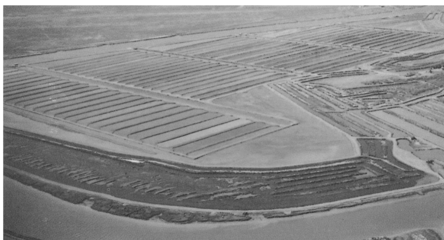
Fig. 1. Semi-intensive sea-bream production in earth ponds in Andalusia (CUPIMAR, S.A.).

† 1998 data from production survey conducted by TROUW Spain.