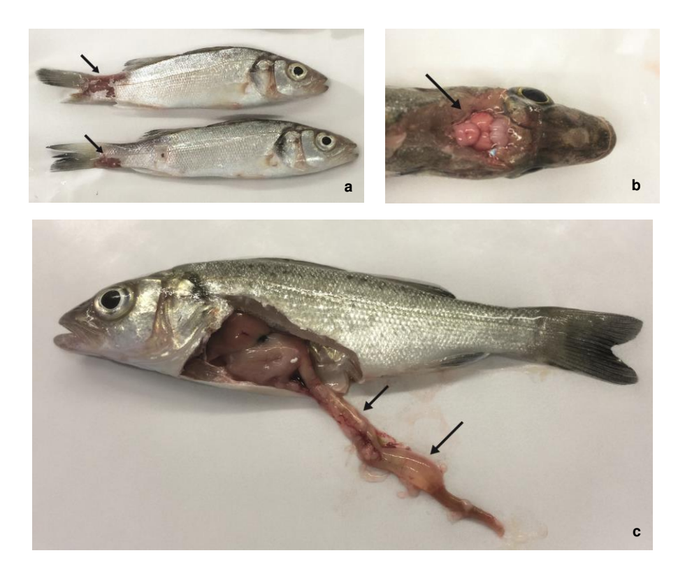
Fig. 9.2. a) Cutaneous erosions and ulcers in D. labrax juveniles (arrows); b) meningeal and encephalic congestion of blood vessels in D. labrax juvenile; c) serous-catarrhal enteritis with marked dilatation of the intestinal lumen (arrows).