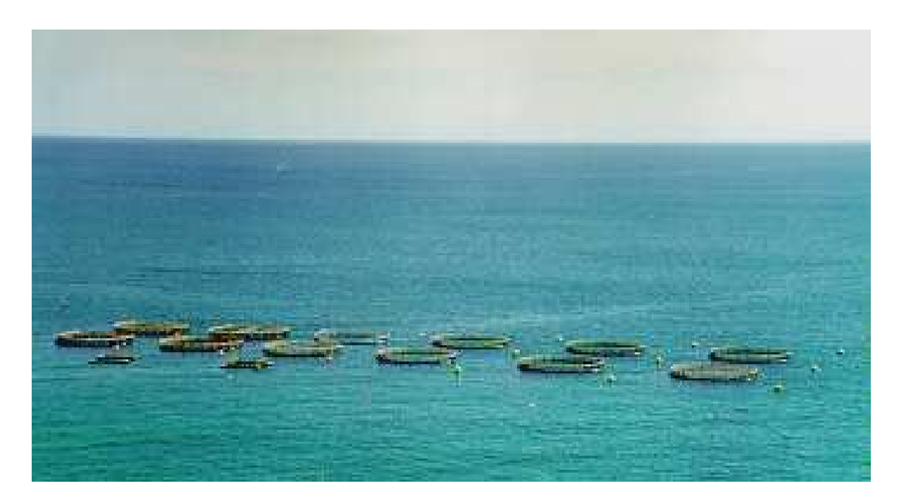
Fig. 1. Sea cages for marine fish farming off the Mediterranean Spanish coast (Corelsa, Spain).

Before the development of the technology for aquaculture in cages (Fig. 1), in the 1960s, most of the fish production took place in ponds and tanks. Since the 1960s, the culture of fish species has progressed significantly due to the farming of certain species, like salmon, sea bream, sea bass, etc., in floating or sedentary cages located in bays, coastal lagoons, fjords, estuaries, interior seas and protected straits.